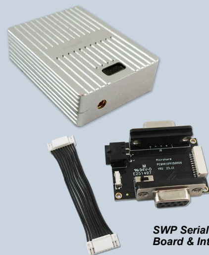
SWP Serial Expander Board & Interface Cable